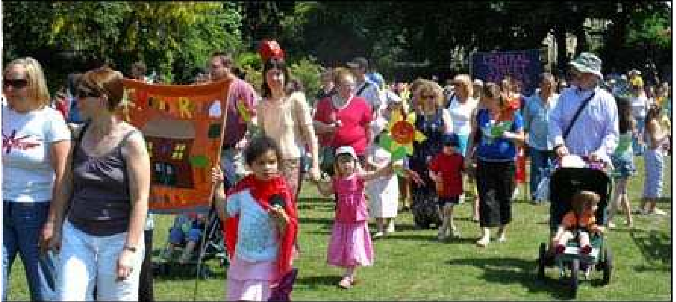
Hebden Bridge Carnival 2006

An intrepid band of volunteers is needed to insure the continuation of the annual Hebden Bridge Carnival. The number of people who have been involved in organising the event over the past 12 – 14 years has now dwindled to such an extent with people moving away or taking other commitments, that last years Carnival rested on the shoulders of only three of the original committee. Indeed, without the support of the partners of the recently established Link Up Properties in Mytholmroyd, it would have been impossible to organise.